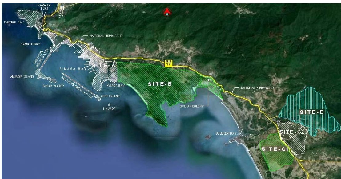
FIGURE 1-1: PROJECT SITES LOCATION IN SATELLITE MAPS – GOOGLE EARTH

1.3.1 The Project work is to be performed in the Naval Base, Karwar, region including a large geographical area along the sea coast at Karwar.