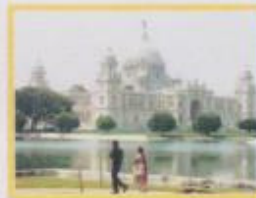
Victoria Memorial Hall

Kolkata is also aptly called the Mining capital of India too because of its proximity to major coalfields and metal mining belts. Headquarters of Geological Survey of India(GSI), Coal India Limited(CIL), Hindustan Copper Limited (HCL)etc. are also located in Kolkata. Academic and Research Institutes on Mining like Indian School of Mines (ISM), Dhanbad, Indian Institute of Engineering Science and Technology(IEST), Shibpur, Indian Institute of Technology(IIT), Khargpur, Central Institute of Mining and Fuel Research(CIMFR), Dhanbad, Directorate General of Mines Safety(DGMS), Dhanbad etc. are all located within a radius of 250 km distance from Kolkata.