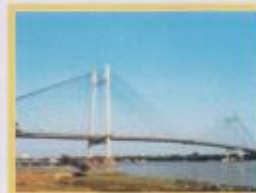
2nd Hooghly Bridge