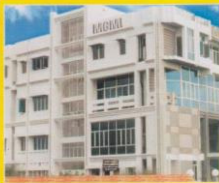
MGMI Head Quarter

and technology. The Institute presently has around 2800 members serving the mineral industry and diversified its valued activities in various fields. The institute is having its headquarters and one of its branch office in Kolkata with 18 more branches throughout the country.